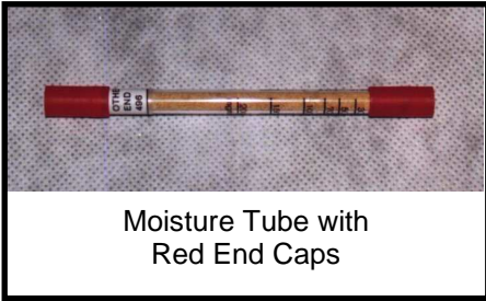
Moisture Tube with Red End Caps