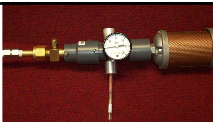
Complete Unit with Moisture Tube inserted

3 Locate the moisture stain tube and find the end marked (insert other end). Carefully break the glass tip off this end by inserting it into the hole on the side of the tube fitting and gently applying sideways pressure. Caution: wear eye protection to avoid injury from flying glass. Then, break the other tip off using the same procedure.